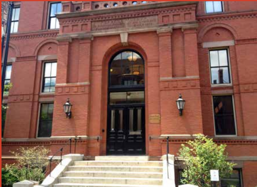
PEABODY MUSEUM OF ARCHAEOLOGY & ETHNOLOGY

The Harvard Museums of Science & Culture (HMSC) offer unique, historic, and captivating venues for a variety of occasions. Steps away from Harvard Yard, our 22 galleries and special exhibit spaces can accommodate everything from intimate dinner parties and cocktail receptions to large-scale corporate events and weddings. Unlike many museum event venues, we are able to offer your guests full access to all museum galleries. Events are scheduled between 6:00 and 11:30 pm, providing your guests with a private viewing of our world-renowned collections. We encourage you to meet with our professional event team who will give you a full tour of the galleries and work hand-in-hand with you to make your event a memorable success. We currently offer event rentals in the Harvard Museum of Natural History and the Peabody Museum of Archaeology & Ethnology. We look forward to working with you.