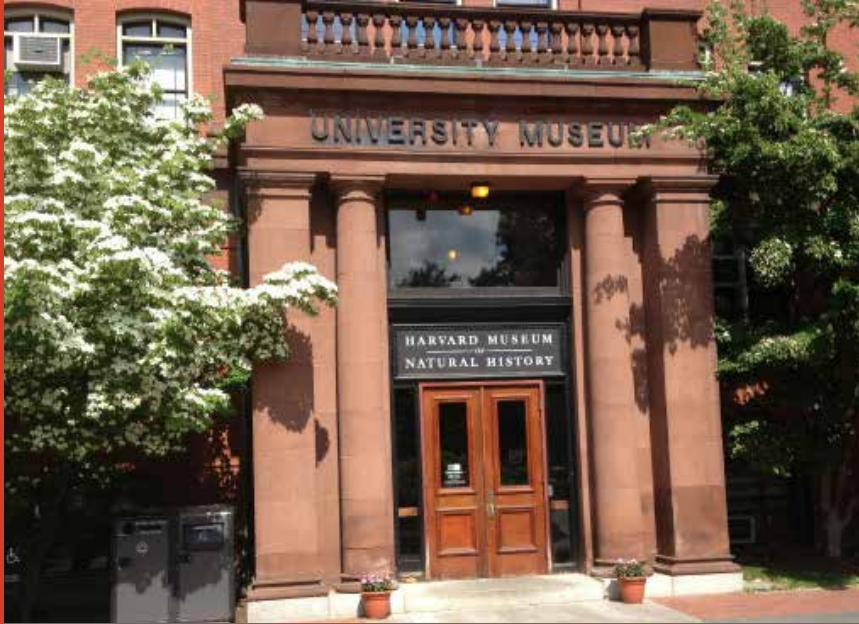
HARVARD MUSEUM OF NATURAL HISTORY